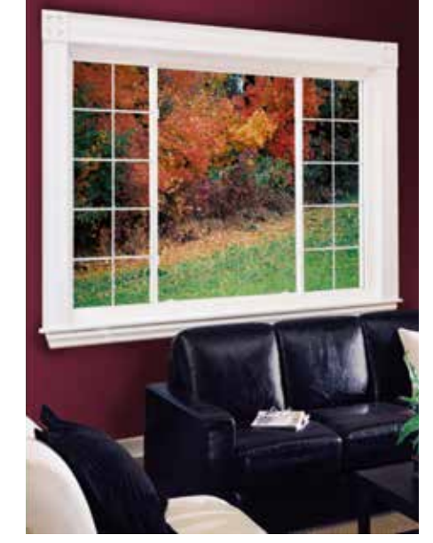
Sliders come in 2- and 3-lite models. 3-Lite Sliders have a center fixed panel and are available in configurations of 1/3-1/3-1/3 and 1/4-1/2-1/4