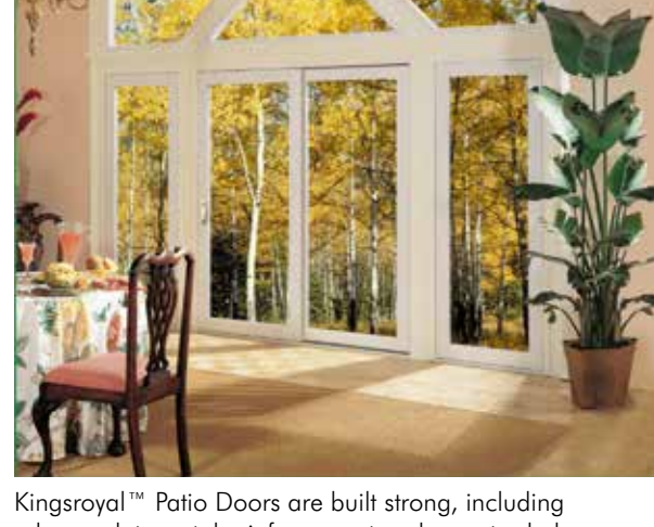
a heavy-duty metal reinforcement and an extruded aluminum screen door frame, while still remaining aesthetically appealing.