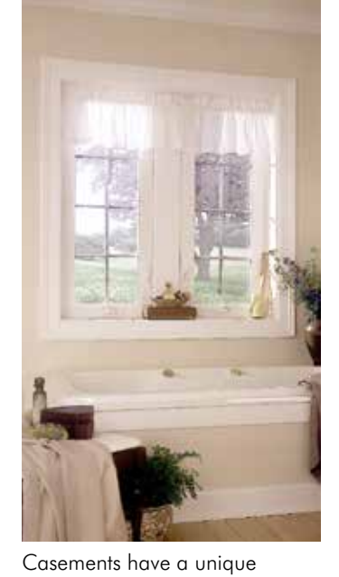
hinge design that allows for easy cleaning from the inside